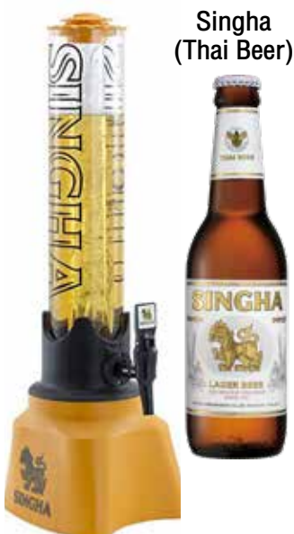
Singha (Thai Beer)