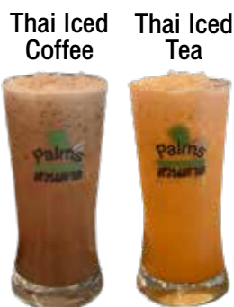
Thai Iced Coffee