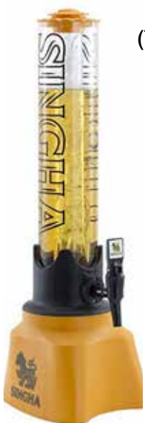
Singha (Thai Beer) Heineken